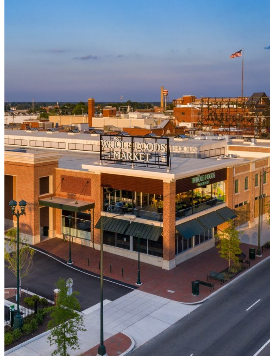
Across the street from new Carmax Headquarters, Pulse Bus stop & Whole Foods